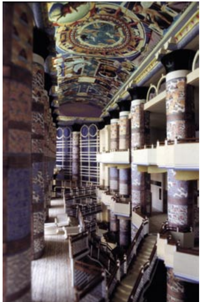
The Gallery of the Judge Institute, which will be 'inscribed' when the Wars of the Arts of Peace are finally understood and joined, fixes thoughts, many complex and diverse thoughts, into over 3,000 aleatory column panels and the more easily 'read' 'cargo' of its 30-metre long Entablature.

A merely solid 'prop', today, of steel or concrete, betrays a metaphysical illiteracy. A fat 'column', filled with stone as did the Ancients, betrays a physical illiteracy. Only the hollow column of the Sixth Order show a proper respect for both the Vita Activa and the Vita Contemplativa.