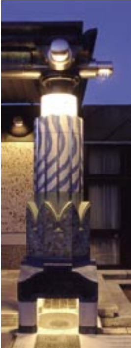
The 'hollow' Ordine of the Wadhurst Millenium Pavilion fixes a patent discourse upon its 'solid' framework of ineffable power.

The way to 'Fix the Present' is to inscribe the Six Planes of the Camera Lucida with a superfluity of thoughts sufficient for the Eye , and the Mind behind it, to achieve that epiphany sought by Heidegger when he proposed that "...if the essence of man is the thinking of being... ". A fabric of thought , externalised into the fabric of a Room , a Building , and most ambitious and brilliant of all, a City , is the way to " think being ".